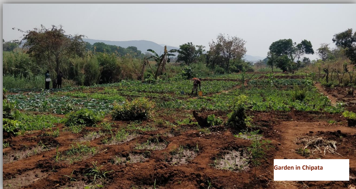
Garden in Chipata

Vegetable projects ensures regular provision of vegetables and fruits specifically for the ill, but also for the general inmate population. The project has a cook, who cooks nutritious meals for the patients.