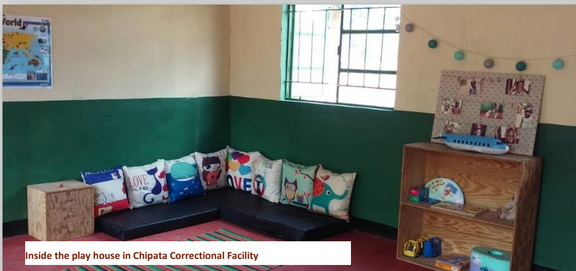
Inside the play house in Chipata Correctional Facility

often translated to presidential pardonings. On average we support an average of 21 children per day in four of Zambia's biggest correctional facilities (Kabwe Maximum and Medium, Lusaka Central