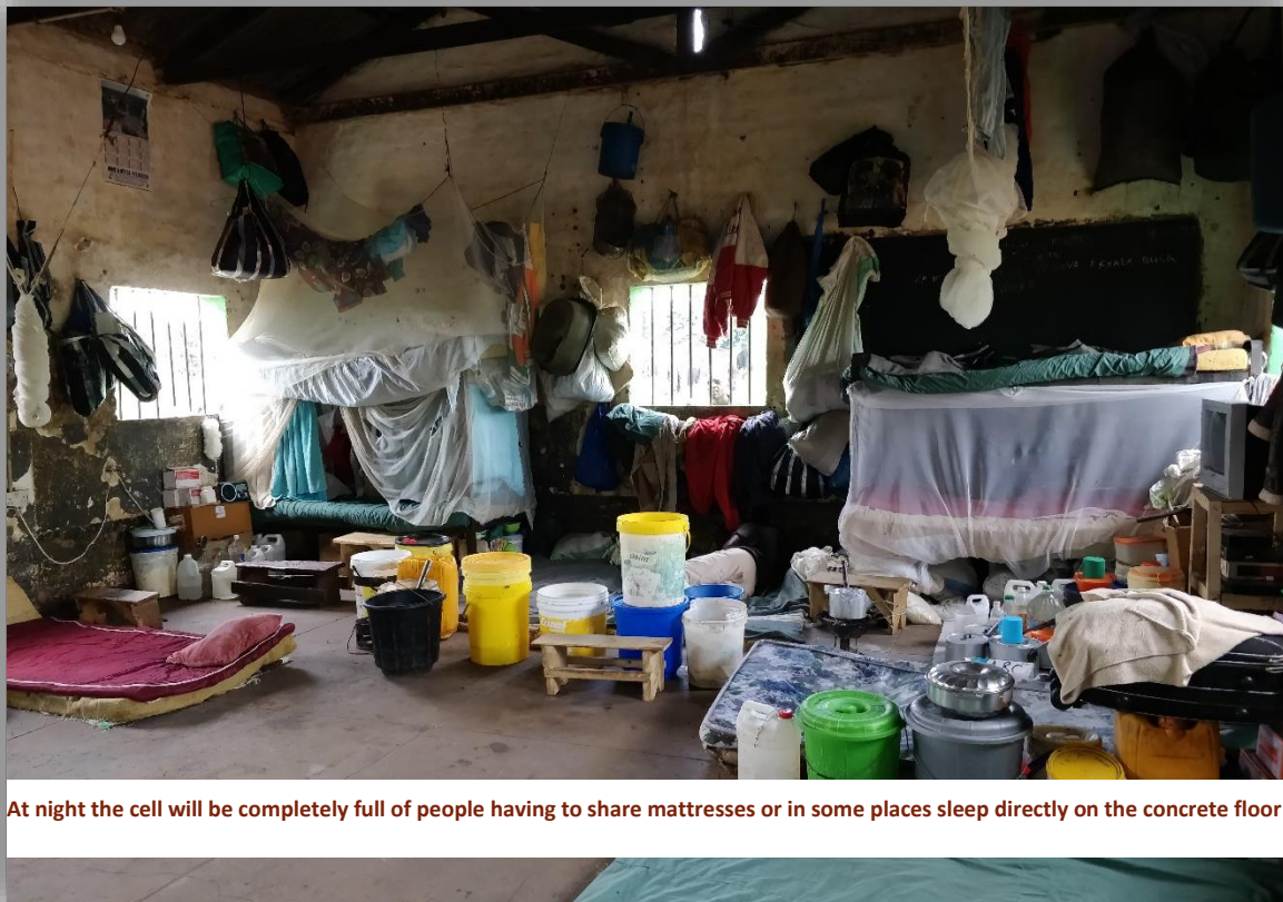
At night the cell will be completely full of people having to share mattresses or in some places sleep directly on the concrete floor

Ubumi mental health project involved training NGO staff, health staff, selected inmates and correctional staff. The health staff will learn more about mental health, various diagnoses and treatment of the same, as well as go through anti-stigma and human rights sensitization. Trainings for inmates and corrections staff included the same topics tailored to them. 32 support group for inmates have been established with great success.