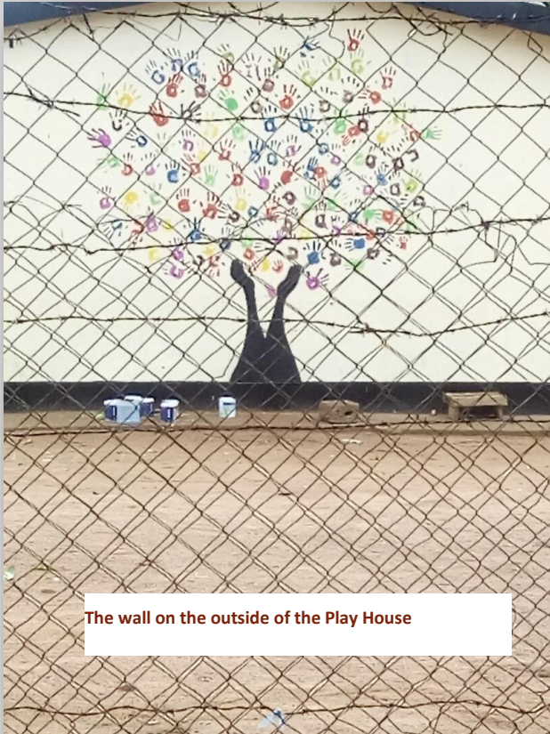
The wall on the outside of the Play House