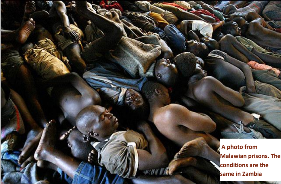
A photo from Malawian prisons. The conditions are the same in Zambia

facilities. The group is managed by an inmate with the title 'Ubumi Inmate Coordinator', who works closely with the correctional facility health staff to deliver quality services.