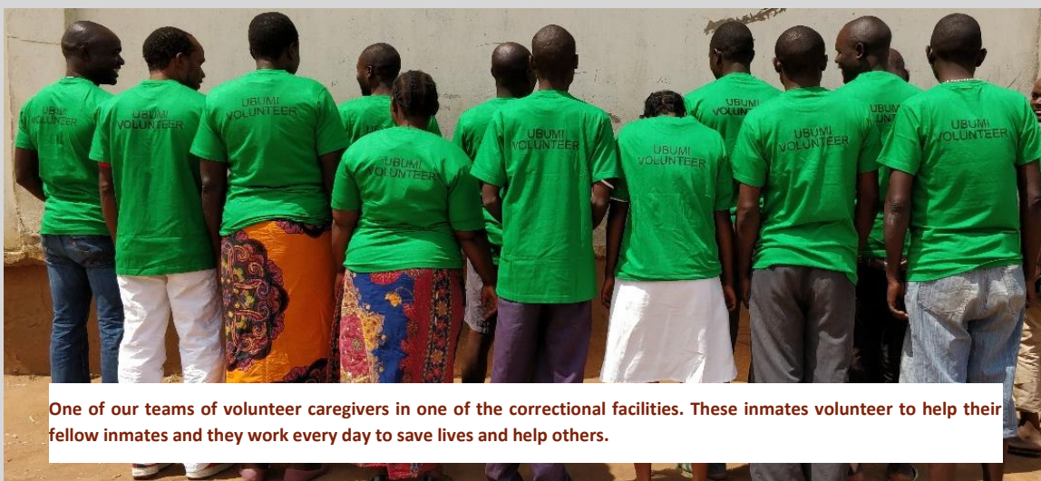
One of our teams of volunteer caregivers in one of the correctional facilities. These inmates volunteer to help their fellow inmates and they work every day to save lives and help others.

The project for the seriously ill entails a team of approximately 10-15 volunteer caretakers, 1-2 cooks, 2-4 volunteer chlorine dispensers and 4-5 volunteer gardeners in each correctional facility. The caretakers are trained in hygiene, nursing, nutrition and the main diseases found in correctional